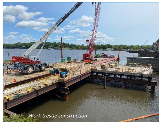
Work trestle construction