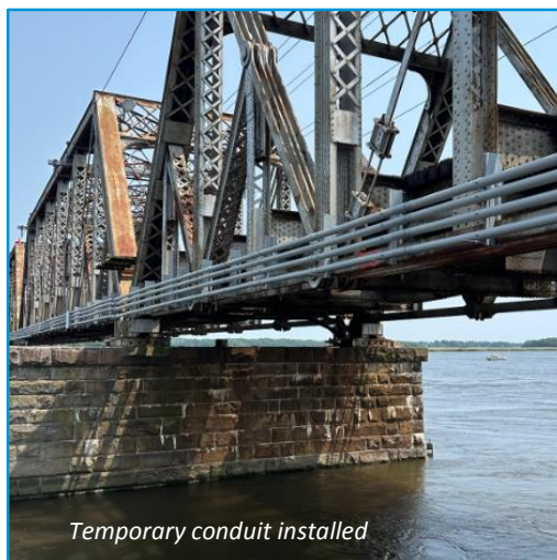
Temporary conduit installed