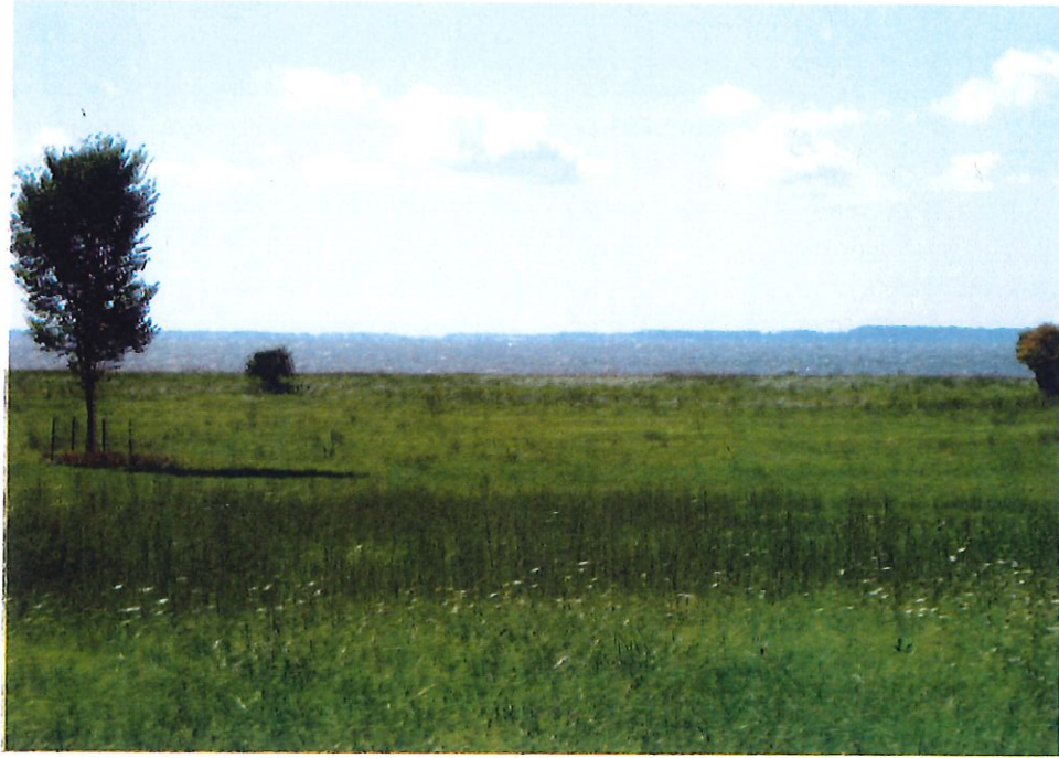
Bartholomew's Field Conservation Easement