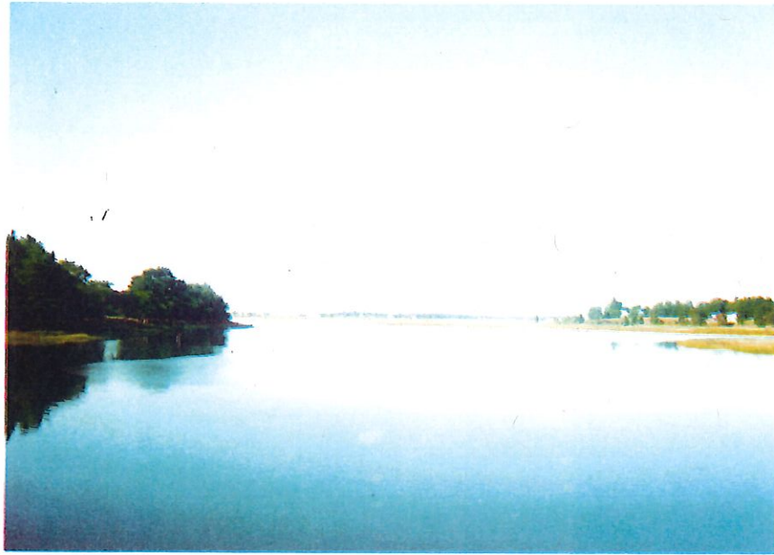
Black Hall River