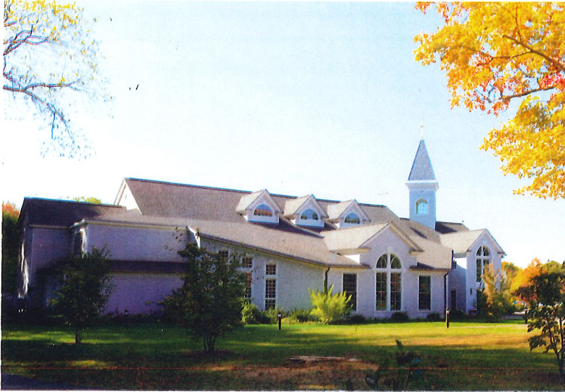
Church of Christ the King