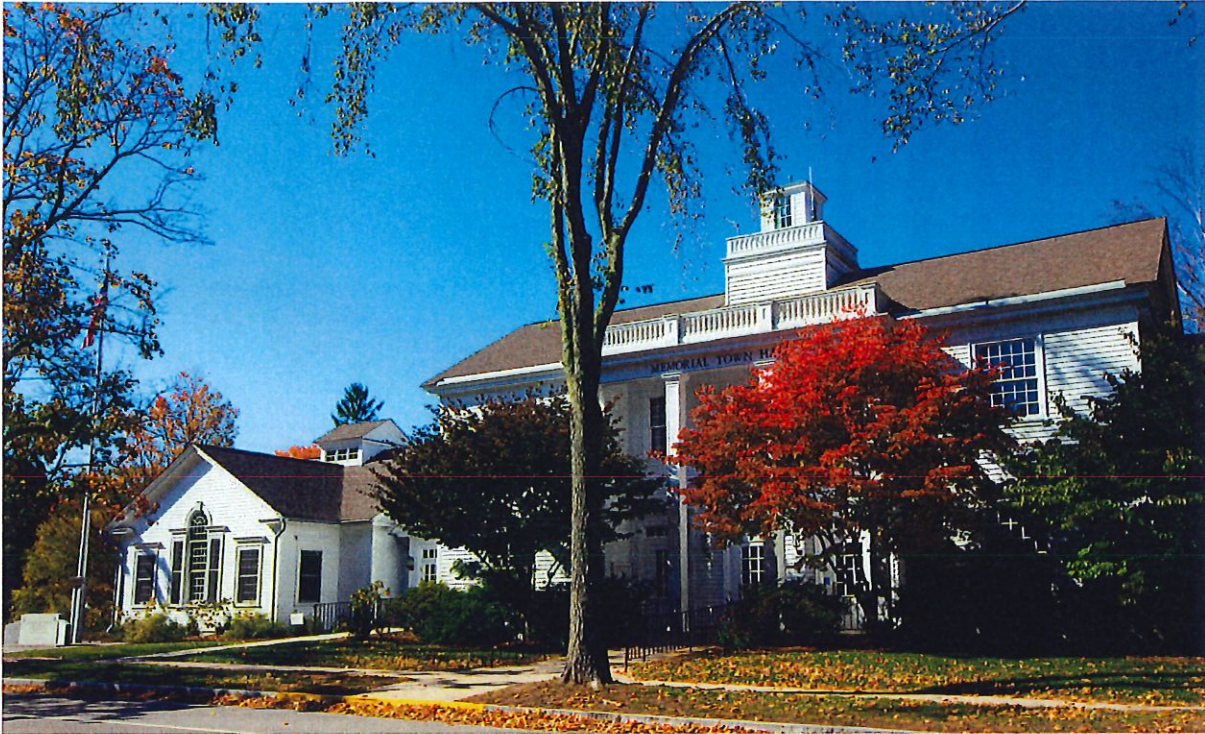
Memorial Town Hall