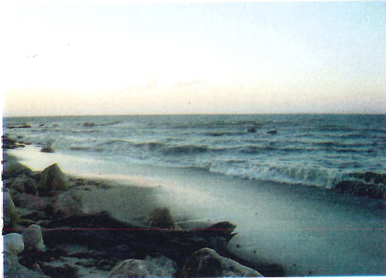
Long Island Sound

Almost 1000 seasonal dwelling units remain in Old Lyme's overcrowded shore communities, built on very small lots before adoption of planning and zoning regulations. Most of the shore area is in a high flood hazard area and in danger of exceeding the capacity of the land to deal with on-site sewage. This requires vigorous enforcement of regulations, especially in view of the strong pressure to convert many of these properties to year-round occupancy. Commercial strip development has increased along Route 156 in the area south of I-95, and beach access and parking are still vital issues. Identifying a clear vision for the future of shore areas remains an important goal.