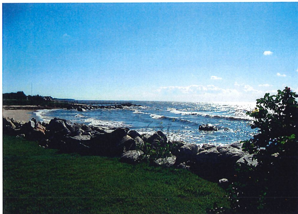
Old Lyme Beach Club and Long Island Sound