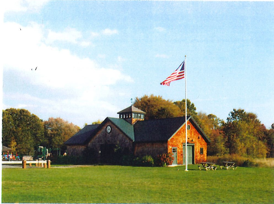
Town Woods Recreational Facility